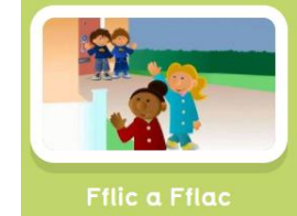
Fflic a Fflac